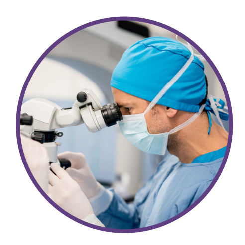
Perform surgery for people who have eye diseases.