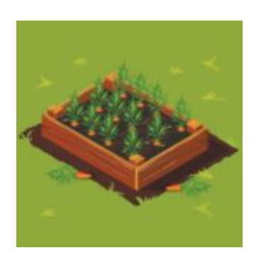
In a planter box