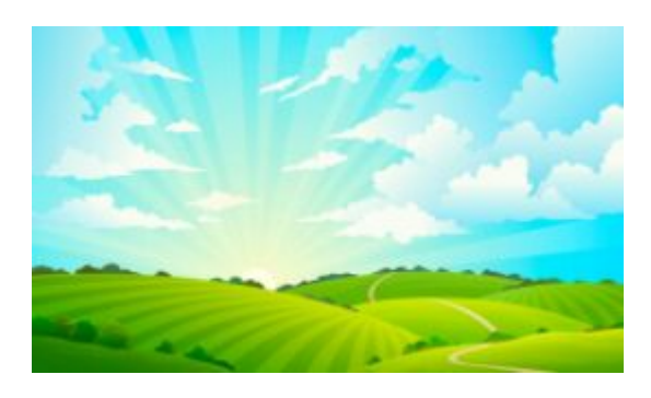
In a large field