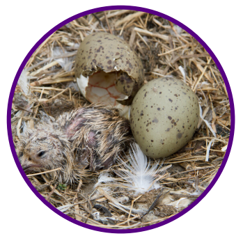
Birth Seagulls hatch out eggs in a nest.