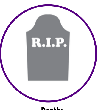
Death: Seagulls live to be about 20 years of age.