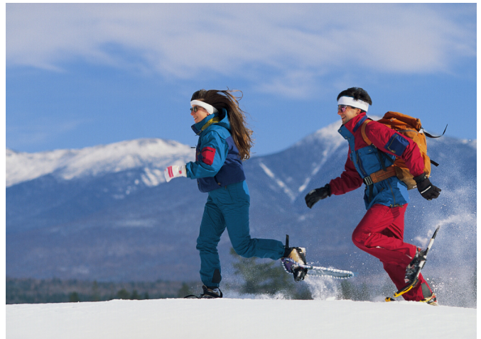
Snow shoeing is a great winter activity for families!