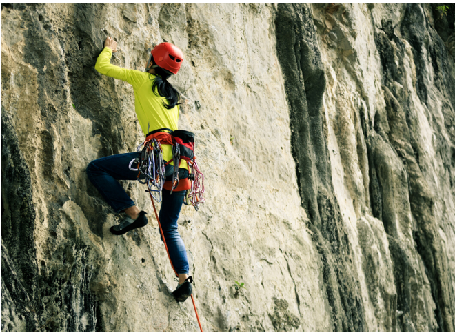
If you are looking for a thrill, try rock climbing during the summer!

There are also activities for people to do in the winter. For example, people can go snow shoeing or sledding.