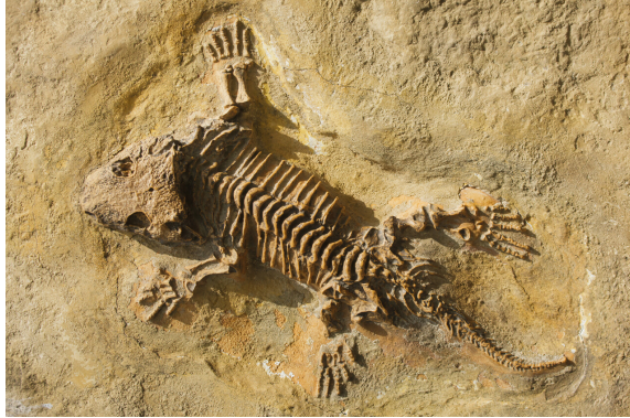
This fossil is of a Seymouria, a type of amphibian from 300 million years ago!

A paleontologist learns about plants and animals that lived millions of years ago. These plants and animals are called fossils. Take a look at these fossils!