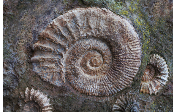
This is a fossil of an ammonite, a type of sea creature from 60 million years ago.

Did you know that fossils provide clues about animals and plants that lived a long time ago? A fossil can provide a clue about the size of a dinosaur. Look at the fossil of a dinosaur below. It is called an Allosaurus. When we look at the fossil, we can see that it is really big! This means that the dinosaur was also really big when it was alive! The Allosaurus was over 31 feet long! That is the same length as a school bus!